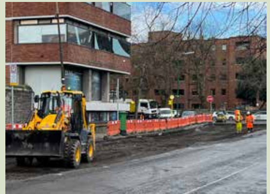
The long overdue surface repairs at the Burlington "Bus Depot" began at end March.

Are you satisfied with the paths and roadways in our neighbourhood? At ULSARA's 2022 AGM members flagged more concerns about the state of our roads than any other topic. Your committee has been assessing our public realm and plans for its improvement. Tell us what you think – send an email to ulsaratransport@gmail.com