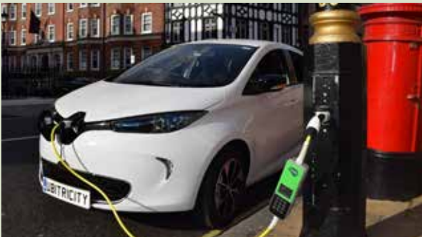
One solution to the EV charging dilemma?

We note more and more homes installing EV charging points in their gardens but is there a need for more public charging points within this area? At present we are only aware of on road charging on Chelmsford Rd. Perhaps mounting charging points is part of the solution'?