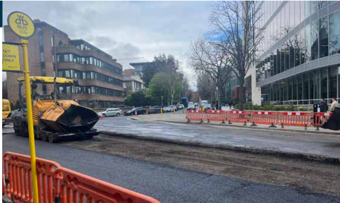
Long awaited resurfacing of Burlington Rd commencing in March 2023

Read ULSARA's submission to ABP on the plans for Charlemont.