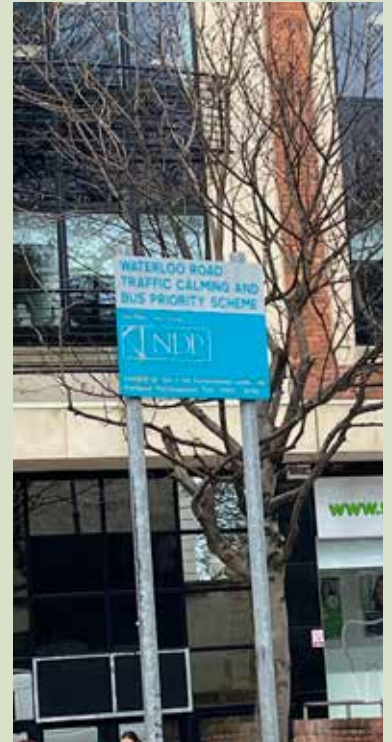
Is it time to remove this sign erected on Waterloo Rd in 2006?

Pedestrians are almost always the poor relation when we think of our public infrastructure. Redundant signage and other unnecessary street clutter, patched up surfaces after utility works, unmanaged root eruption from highly valued trees all seem to be invisible to city management. ULSARA is compiling a list of pavement clutter and other footpath issues to be forwarded to the Council. Please send items for inclusion to ulsaratransport@gmail.com